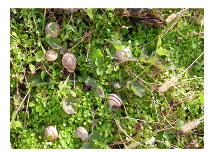
Fig. 2. Mature individuals of Eobania vermiculata in Costinești near future (GROSSU 1983). In the last two decades, there has been an expansion of the Mediterranean species both in the east and in the northwest of their original range (MIENIS 2002, UESHIMA et al. 2004, AL-KHAYAT 2010, PELTANOVÁ et al. 2012, AL-KHAFAJI et al. 2016, RONSMANS & VAN DEN NEUCKER 2016, PÁLL-GERGELY et al. 2020). The purpose of this short communication is to confirm with certainty the first record of Eobania vermiculata (O. F. Müller, 1774) in

The terrestrial gastropod fauna of the Dobrogea region has been studied since the 19th century, being the subject of numerous works until the last decade of the 20th century (MONTANDON 1887, LICHERDOPOL 1900, GROSSU 1972, ZEISSLER 1983, NEGREA 1994). During the period 1990-2020, the region was monitored annually in April-May and September-October. On April 30th 2015, on the seafront of Costinești Town (Fig. 1), 22 mature specimens of E. vermiculata were found in the Flutist Girl Statue Park (43°56.62'N, 28°38.29'E).