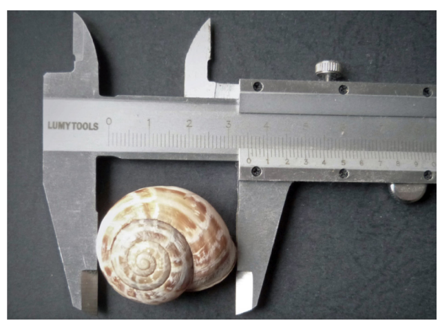
Fig. 3. The largest shell of Eobania vermiculata from Costinești

The habitat in which the snails live is located on a terrace, 6 metres above sea level, right on the seafront, 20 metres from the sea shore. The bedrock is composed of Sarmatian limestones, covered by a loess deposit and consolidated sands and clays. The habitat is a wasteland, bordered by a hedge of Ligustrum vulgare, with Elaeagnus angustifolia and an association